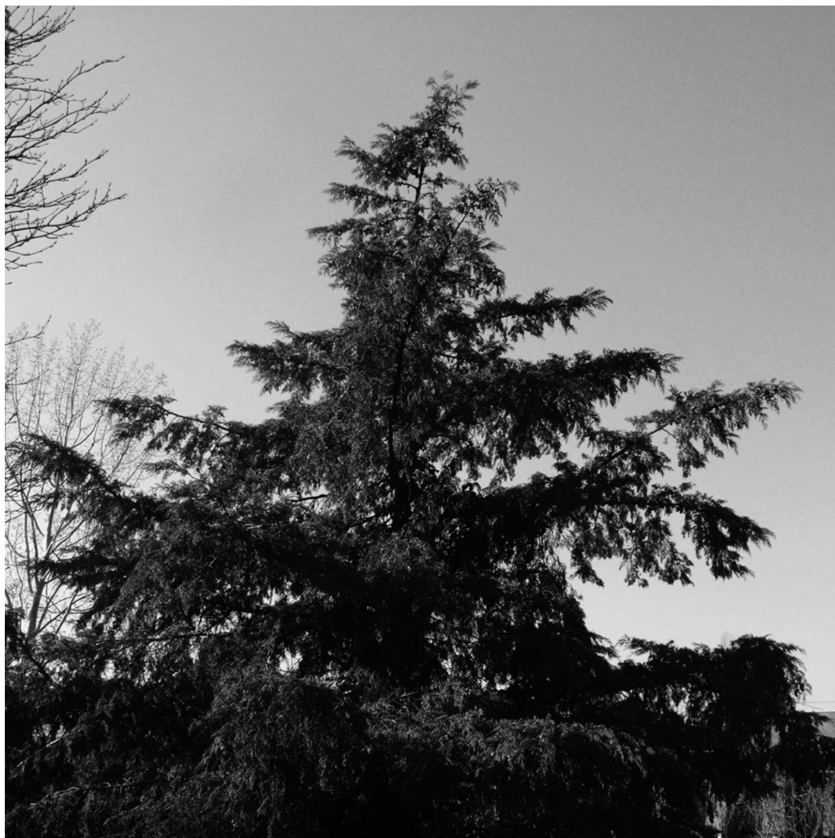
Figure 3: Himalayan real cypress in the Arboretum in Buda

It is not enough, however, to give lists of new species as such lists are subjective based on only a few domestic individuals. It is important therefore to predict in objective ways based on controllable scientific methods what taxa (maybe limited to species due to the lack of data) are expected to advance in our gardens in the future. In contrast to botanists for the landscape designer not the future distribution area of the given plant is interesting but rather whether the plant finds good life conditions in good garden conditions or not. Thus in contrast to area shift it is much easier and more accurate to estimate and model which areas will meet the climate demands of the selected species in the future. Demand of the plant can be determined accurately based on its current distribution area and the meteorological data sets of past centuries. Considering this, research has been initiated in the Corvinus University of Budapest to model the shifting towards the north of areas appropriate for species demanding warmth, mainly Mediterranean pines. Predictions to the period between 2011 and 2100 were prepared based on various climate scenarios.