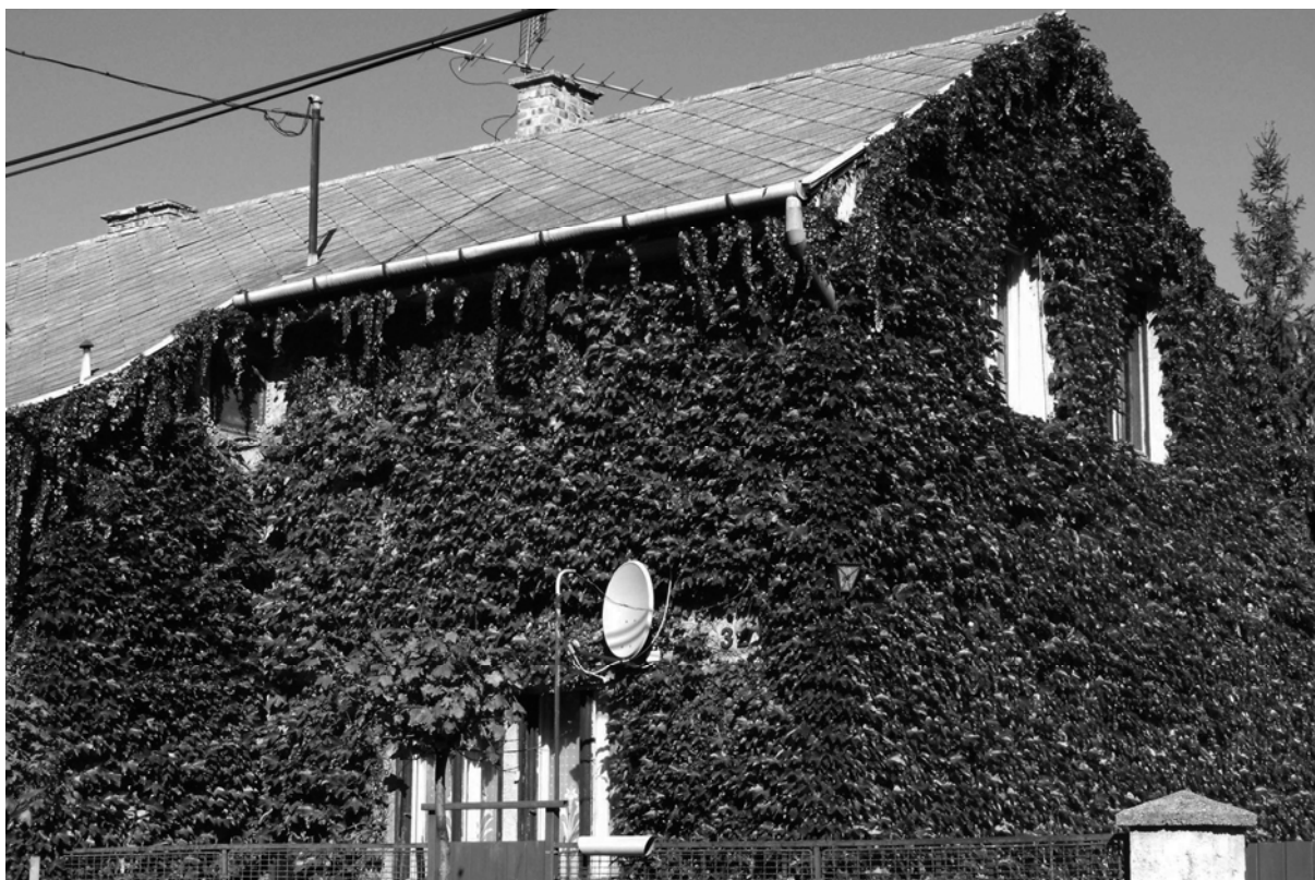
Figure 1: Good example of a facade overgrown by woodbine in Budapest.

Establishing green facades is not widespread in Hungary in contrast to green roofs. They include greening outdoor walls by vegetation, wood species or mounted green facade elements planted into special wall holes. In a wider sense creepers climbing up the walls – with the help of a support network or not – are classified into green façade category as well. This latter seem to be the most sustainable system and in the drier climate of Hungary plantation of creepers is recommended to be supported instead of mounted green facades.