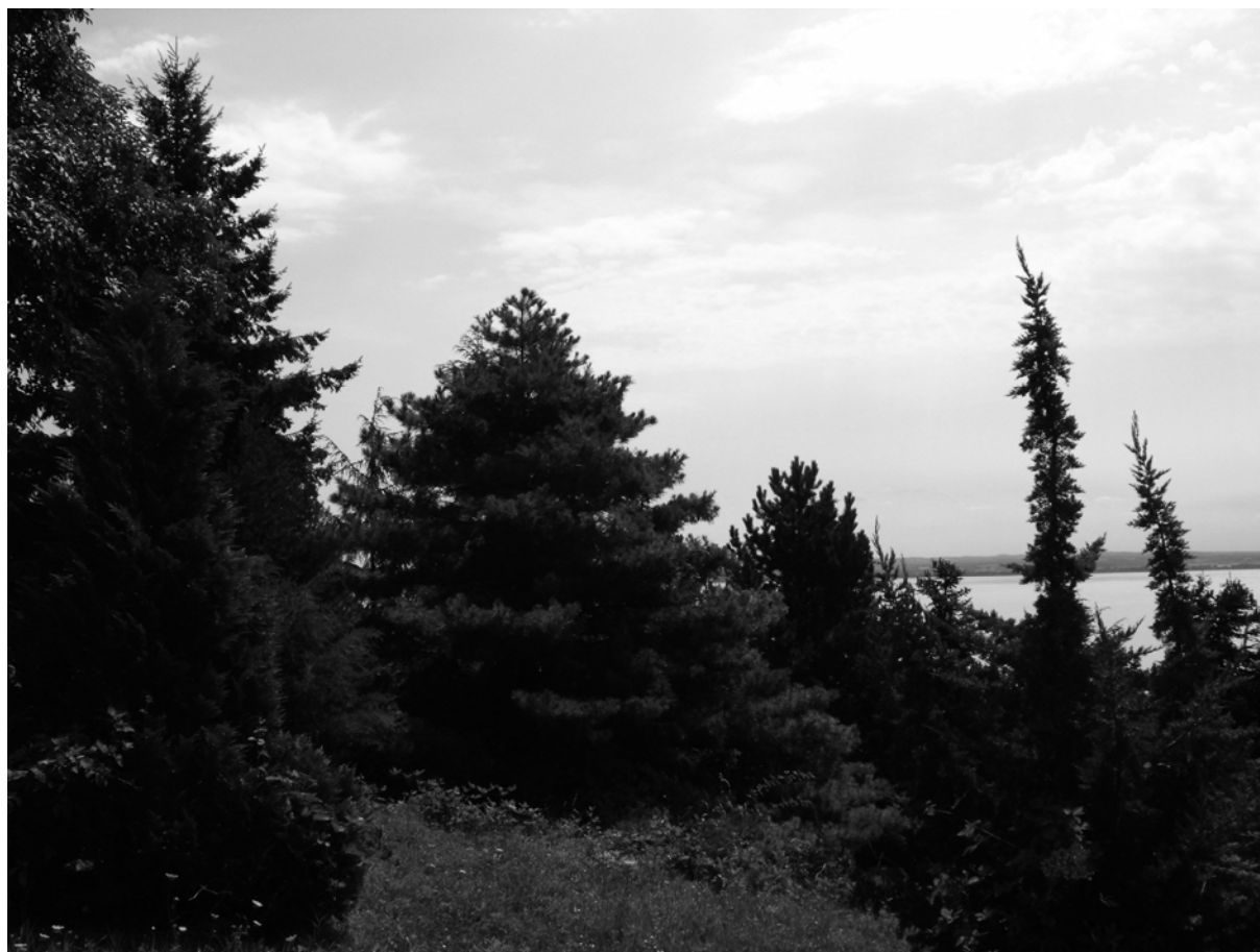
Figure 2: The Folly Arboretum in Badacsonyörs is the home of old plants of several rare warmth demanding species. In the foreground a Chinese juvenile cone can be seen.

demanding species are from the Mediterranean, western shores of North America and the Far East.