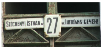
Picture 1 New and old style bilingual street signs in Berehove

squares is going on. This is why we ask the residents of Berehove, especially the owners of houses at crossroads, to take the replacement of street signs with understanding, and to help with the work. Replacement will take place according to the laws that are in effect. In addition, nameplates will help citizens, tourists, the ambulance service and other service providers to find their way in the town” (date of publication: 31 March, 2016).