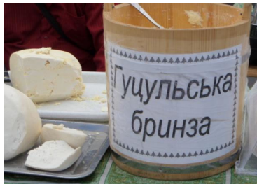
Picture 2 Monolingual inscription on goat cheese sold at a street fair on Berehove Town Day (May 2017) 5