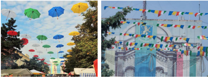
Picture 5 The main square in the colors of the national flags of Ukraine and Hungary (blue-yellow, red-white-green, respectively) on Town Day 2016 and 2017

Thus, both in language use and in the use of symbols one can distinguish two ethnic groups in Berehove. In the use of symbolic systems, first of all, emphasis on a neighborhood and harmonious living side by side is the centre of attention, playing down extremist nationalist ideologies: i.e., a culture-specific order approved by the state functions in the town (Ilyés 2010:116). In a multiethnic community without extremist nationalist forces, multilingualism becomes natural and routine. As a result, symbolic systems of various ethnic groups coexist alongside each other. Nationalism emerging in a multiethnic community due to the long-term coexistence of such groups may develop owing to transactionalism (Conversi 1998). The essence of transactionalism lies in those exchanges and interrelations between ethnic groups that loosen the borders between the groups (Barth 1969, 1996), thereby making border crossing much easier, unlike the nationalist ideologies that build up borders between ethnic groups.