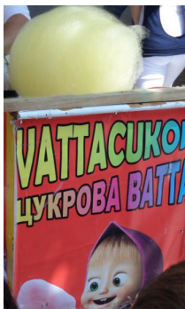
Picture 4 Candy floss vendor with Hungarian and Ukrainian inscriptions

Rovas encoding (an old Hungarian script) can be found first of all on some Transcarpathian settlements' nameplates (Karmacs 2014a, 2014b) but it is less often used for the names of goods and services. Despite the dominant Ukrainian Town Day medium, Szekler script could also be found in the promotional