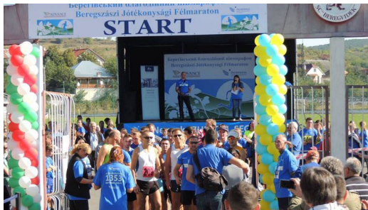
Picture 6 The fixed symbolic system of Berehove programs – use of the Hungarian and Ukrainian national colors (on the left of the gate, red, white and green balloons, and on the right blue and yellow balloons)

Thus, both in language use and in the use of symbols one can distinguish two ethnic groups in Berehove. In the use of symbolic systems, first of all, emphasis on a neighborhood and harmonious living side by side is the centre of attention, playing down extremist nationalist ideologies: i.e., a culture-specific order approved by the state functions in the town (Ilyés 2010:116). In a multiethnic community without extremist nationalist forces, multilingualism becomes natural and routine. As a result, symbolic systems of various ethnic groups coexist alongside each other. Nationalism emerging in a multiethnic community due to the long-term coexistence of such groups may develop owing to transactionalism (Conversi 1998). The essence of transactionalism lies in those exchanges and interrelations between ethnic groups that loosen the borders between the groups (Barth 1969, 1996), thereby making border crossing much easier, unlike the nationalist ideologies that build up borders between ethnic groups.