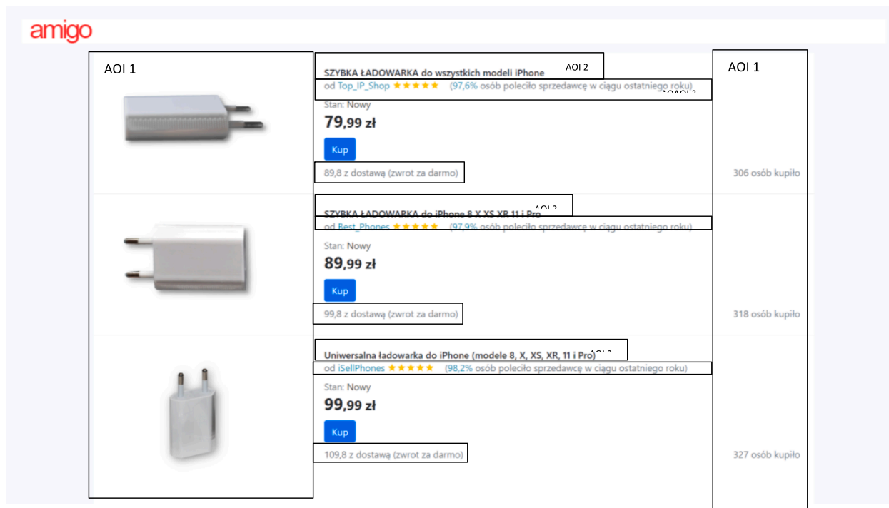
Fig. 2. Areas of Interest (AOI) for a listing page of a low involvement purchase: an iPhone charger. AOI product signals: 1 - photo, 2 - title, 3 – product rating, 4 – price; AOI logistics signals: 5 – buy button, 6 – logistics (price with delivery, return for free), 7 – who bought – where would you classify it?