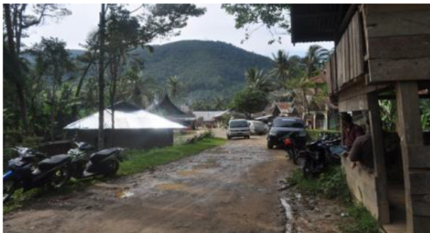
Figure 3. Nagari simanau. https://gadangdirantau.com/2012/09/01/solak-batu-bajanjang-jalan-tidak-begitu-rusak/ .