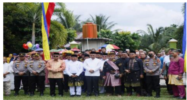
Figure 4. Rumbio indigenous people. https://kominfosandi.kamparkab.go.id/2022/08/28/halal-bihalal-dengan-persukuan-domo-kenegerian-rumbio-ka-msol-lestarikan-adat-istiadat-dan-jadikan-hukum-yang-kuat/ .