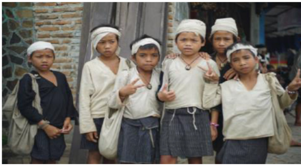
Figure 2. Baduy tribe.