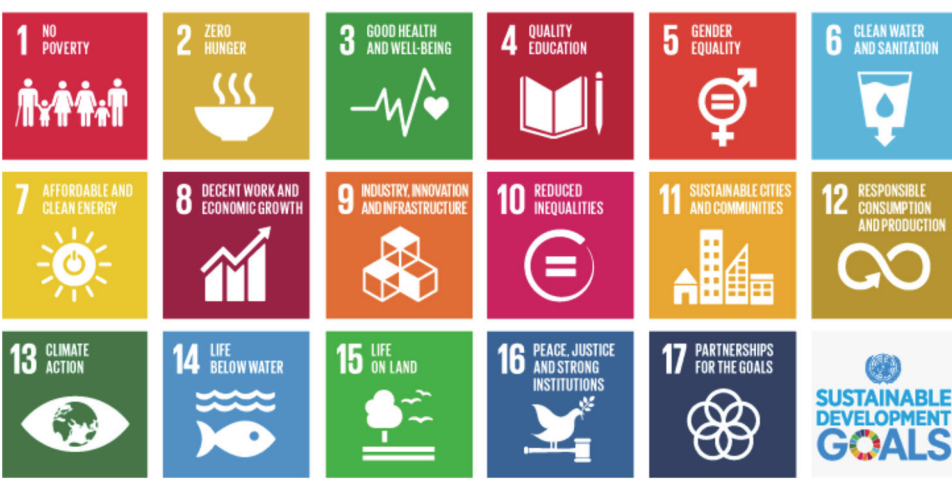
The 17 UN sustainable development goals SUSTAINABLE GOALS 17 GOALS TO TRANSFORM OUR WORLD