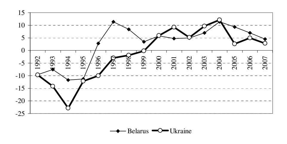
Figure 1. GDP Growth in Belarus and Ukraine in Constant Price Level (year-on-year, percentage)