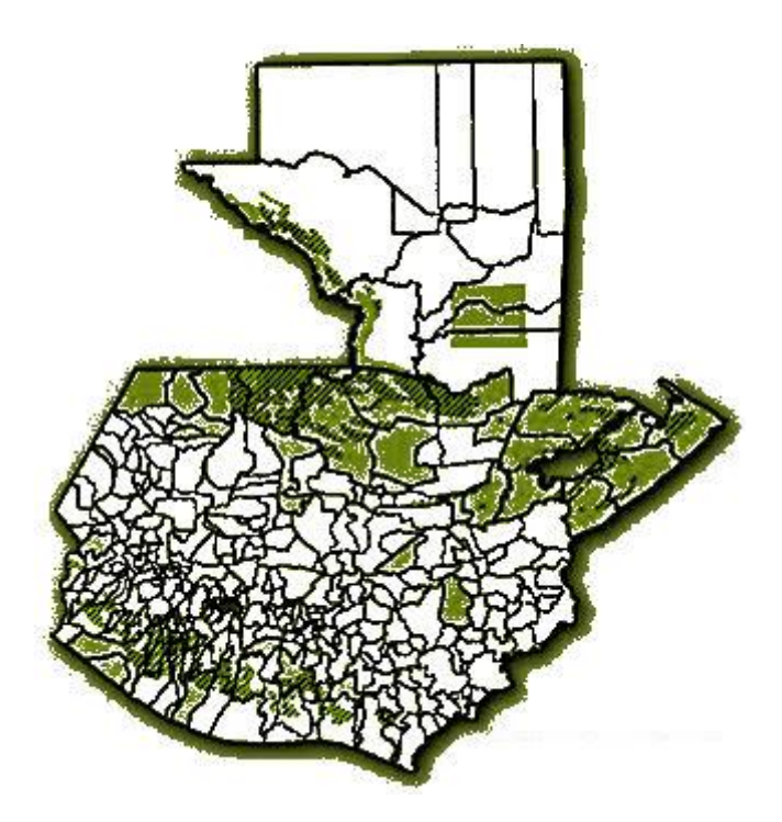
Figure 3: Map of Guatemala showing existing palm plantations and potential areas

north of the country. The following map shows the lands that are being legalized for the palm plantations and the potential areas where more productivity can be obtained.