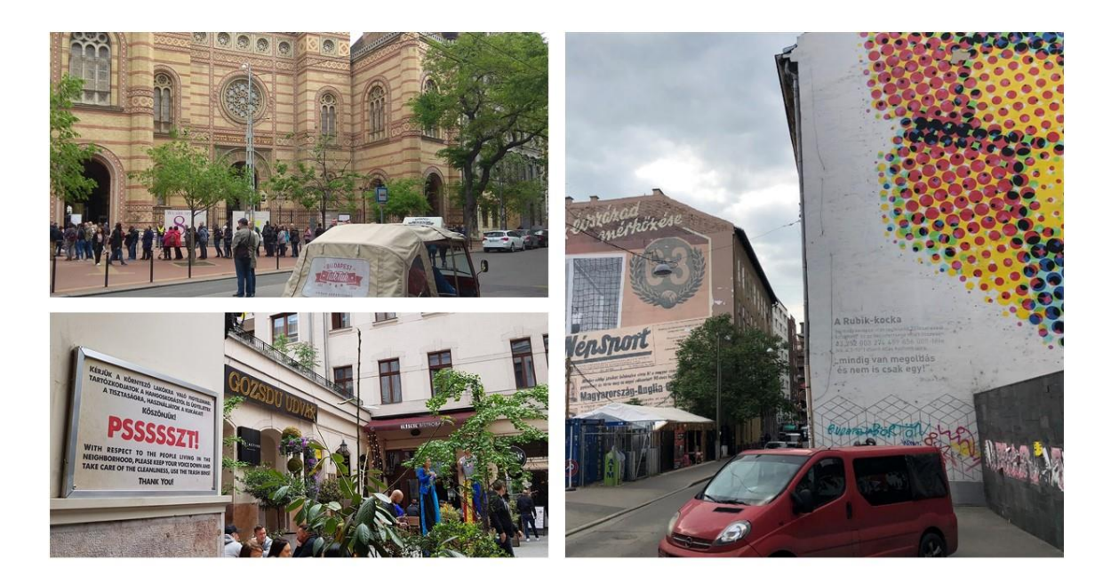
Figure 3. Main components of daytime tourism milieu in Budapest's party zone. Upper left: Dohany Street Synagogue; lower left: Gozsdu Court as an iconic gastronomic place; right: street art on fire walls

Photos of traffic culture, i.e. old-type yellow trams and old metro stations formed the transportation sub-category, which had a 6% share in the total photos. The accommodation sub-category was composed of hotel and hostel photos, and accounted for 2% of the total photos. 80% of the accommodation photos captured Arkad Bazar Hostel, which has varied architecture composed of socialist and old ruined styles, and is located in Dohany Street. Souvenirs and guided bike tour photos generated the supplementary services and facilities sub-category, which had a share 2% of the total photos.