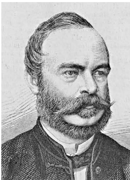
LÓNYAI MENYHÉRT (Minister of Finance, subsequently Prime Minister in 1871–1872)

The 19th century saw the beginning of a new era of control as certain states underwent constitutional transformation in the aftermath of the French Revolution, and the budgetary rights of parliament were recognised in virtual-